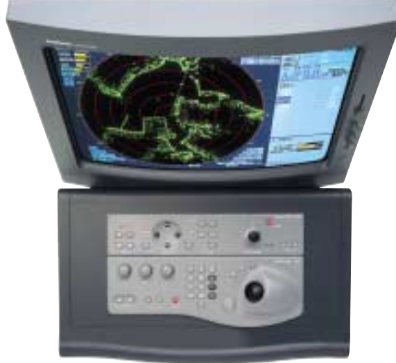
Pathfinder®/ST MK2 Radar