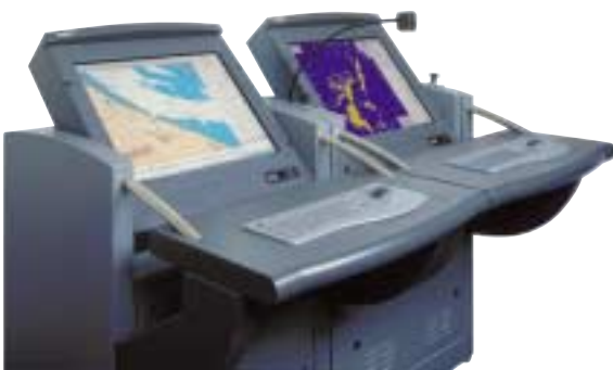
MFC - Consoles