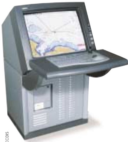
Pathfinder®/ST MK2 ECDIS