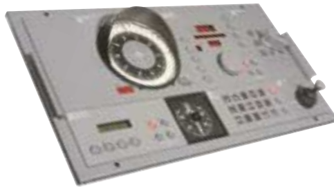
NautoPilot® 2000 Series