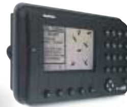
AIS MX 420 Display