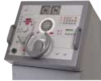
ComPilot® 20 Bridge Steering Stand