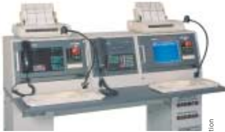
GMDSS A3 Station